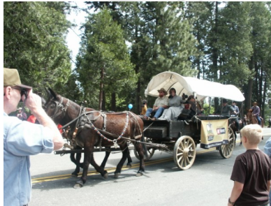
WAGONS IN THE PINES