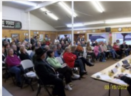
Supporting local small businesses. Abusive Lawsuit Conference at the COMMUNITY CENTER.