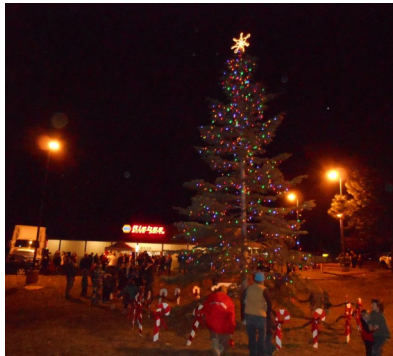
Christmas Tree Lighting ceremony, and TREES FOR TEENS